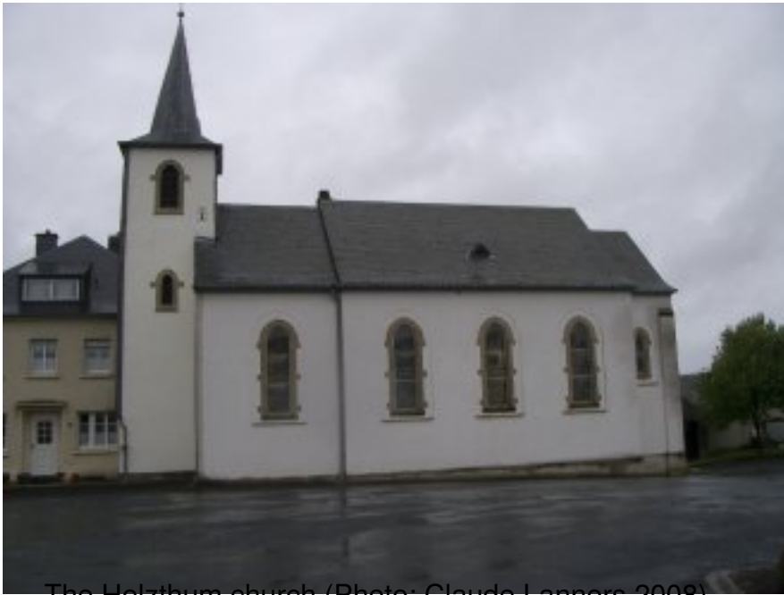
The Holzthum church