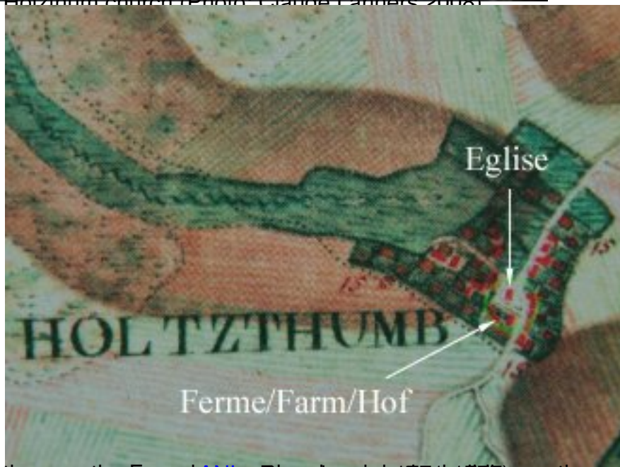
Holzthum on the Ferraris map, the church is the building on the square in the center of the village ( ANE , Ferraris map 1771-1777)