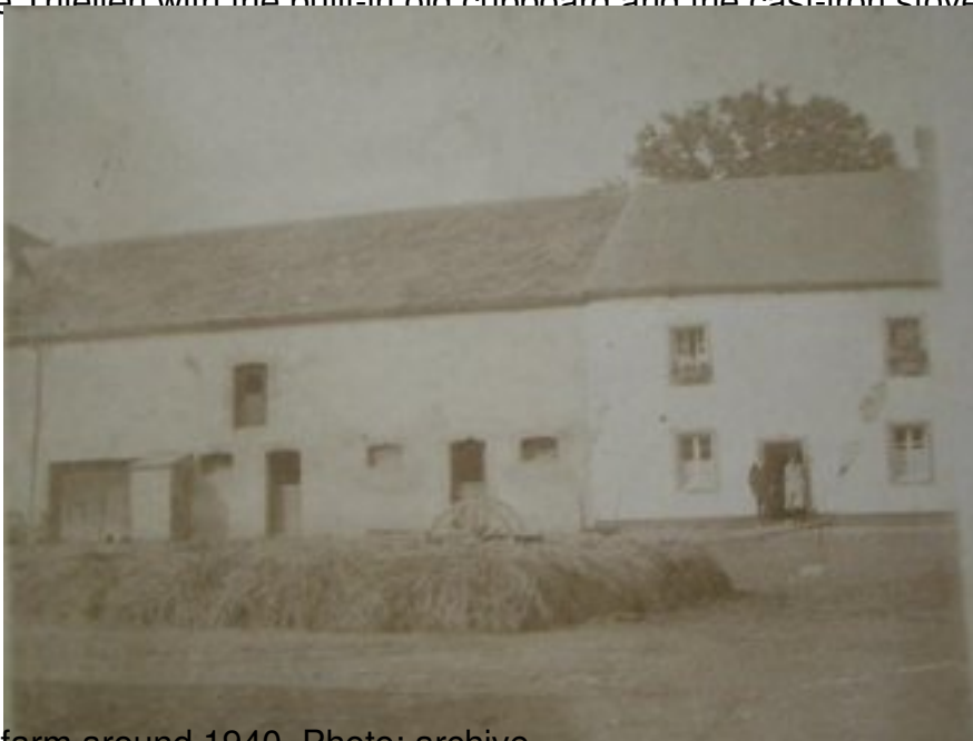
The farm around 1940